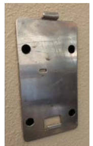
Mounting Plate on the Wall

2. Screw the metal mounting plate onto the wall and hang the machine on it, making sure both tabs catch. Snug and secure wall mounting is important to avoid spills and lower the vibration noise of the pump.