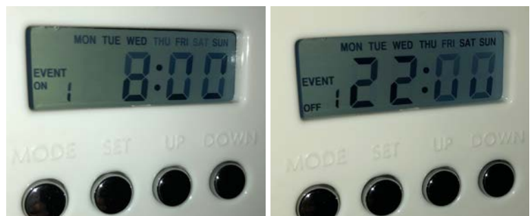
This event comes on at 8:00 AM and shuts off at 10:00 PM every day of the week.