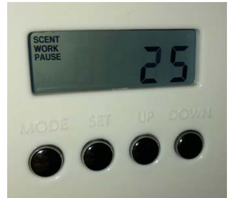
This is at 25% intensity.