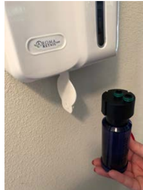
Align the cap this way.