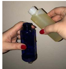
Pour in the oil.