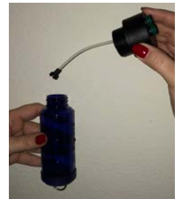
Screw on the diffuser cap.