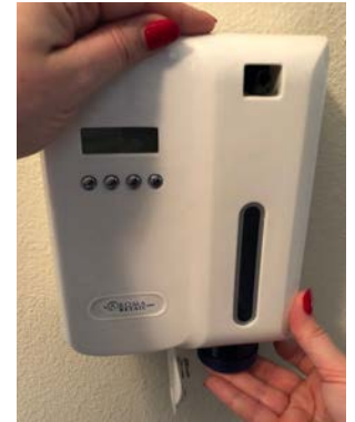
Pop it up in place.

If the diffuser starts to whistle or you suspect that it is not running optimally, it may be time to clean the diffuser. To do this, pop out the cartridge, unscrew the diffuser cap, pour out the fragrance oil into the white bottle that it came in, put some alcohol into the cartridge (you only need enough to get to the first tick mark), replace the diffuser cap, pop the cartridge back in place, and run the machine for a while to let the alcohol clear out any fragrance oil buildup in the diffuser cap. You can use 80-proof vodka if you do not have rubbing/isopropyl alcohol. Pour out the alcohol and replace the canister with the fragrance oil and it should be good as new.